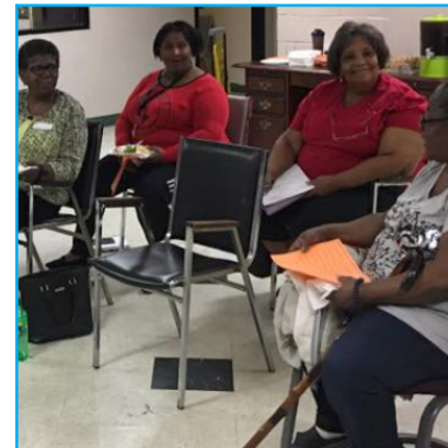
Resident Leadership Council Meeting