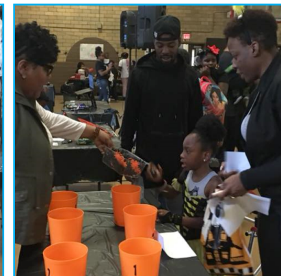
Spooky Ooky Fall Festival