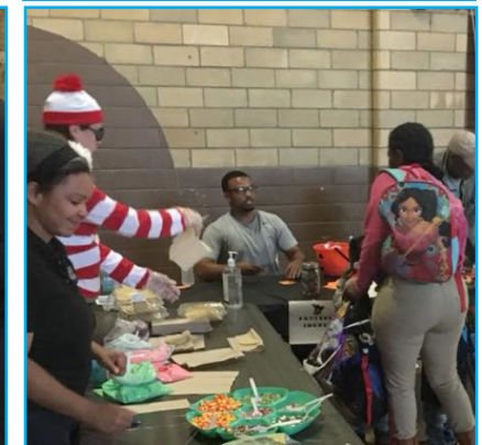
Spooky Ooky Fall Festival