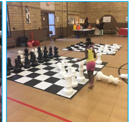
Family Game Night