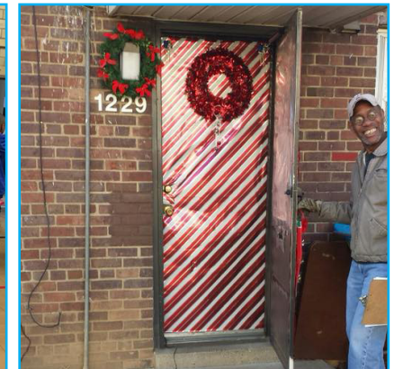
Door Decorating Contest