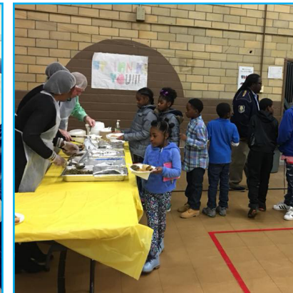
Family Harvest Dinner