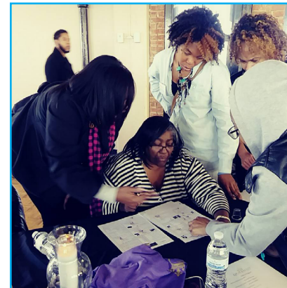
Blueprint of a Queen Luncheon and Workshop