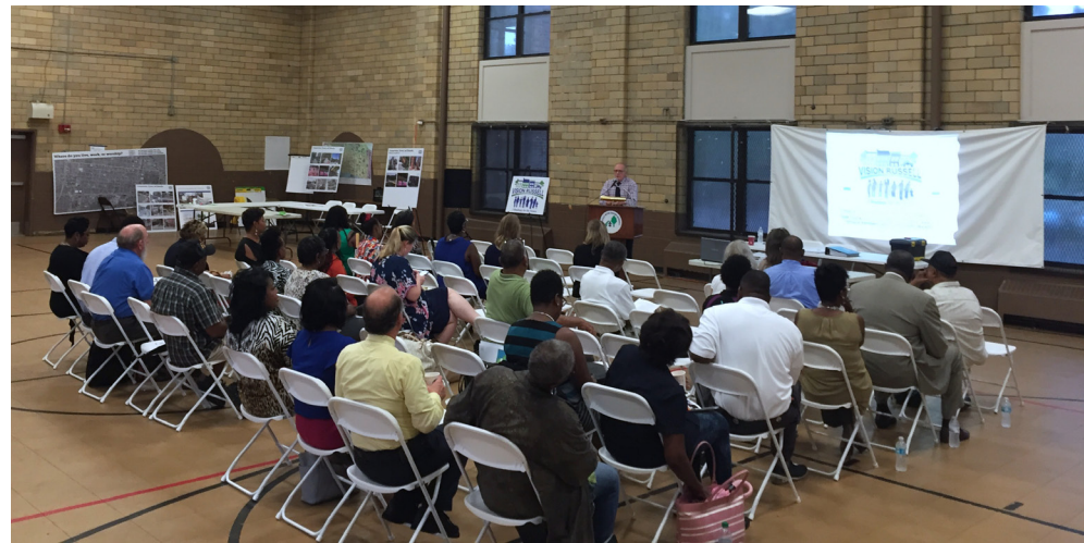
Action Activities Workshop 08.17.2016